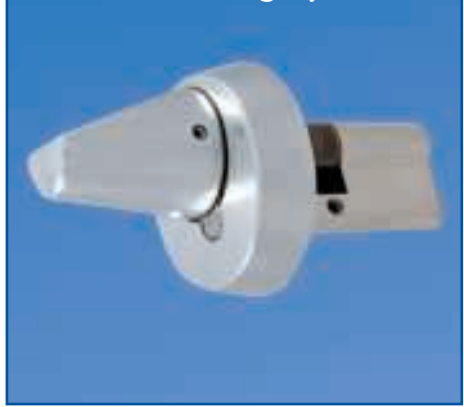
We can convert most euro cylinders to clutch operation by adding our antibarricading knob. Please contact us for details.