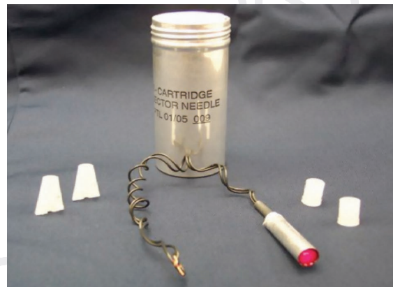
Needle Cartridge NSN: 1370-99-915-4984