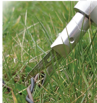
Flying Scalpel NSN: 1377-99-232-3236

The Flying Scalpel is a device which can be fired by the Needle or Needle (Plus) Disruptor and may be used to cut cables, cords or similar targets.